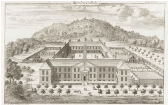
Photo credit: Illustration of Morden College from John Strype's 'A Survey of the Cities of London and Westminster.' 1720c

Structural Engineer Michael Hadi Associates